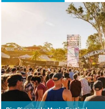
Big Pineapple Music Festival