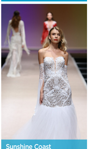
Fashion Festival, Caloundra