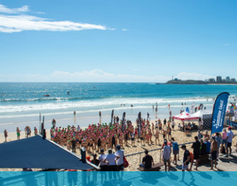
Mooloolaba Beach Festival