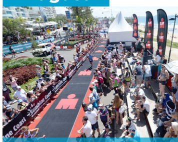
IRONMAN 70.3 Sunshine Coast