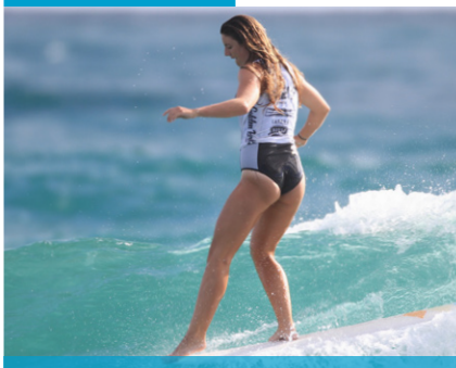
Queensland Surf Life Saving Championships - Juniors, Masters and Seniors