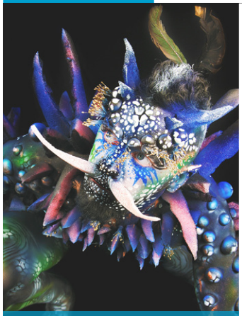
Australian Body Art Festival, Cooroy

Sunshine Coast Ukelele Festival. Kenilworth