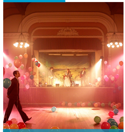
Heart of Gold International Film Festival. Gympie