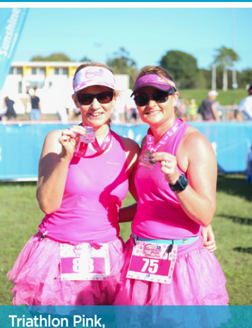
University of the Sunshine Coast